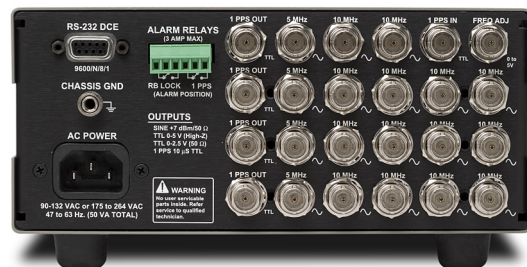
FS725 rear panel (with Opt. 03)